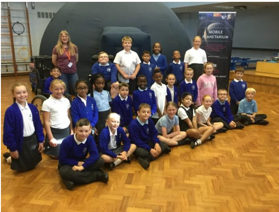
Heron Class enjoyed the astrodome visit as part of their super starter to their new topic.